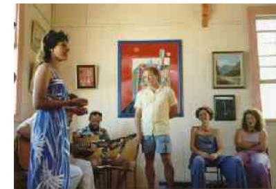
After the Whaingaroa Work Cooperative moved to their own building at the Kokiri Centre in 1994, management of the Old School passed to the Raglan Community