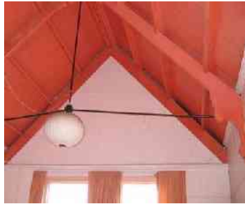
The photo on the left of the 1906 LHS room shows the cathedral ceiling which provides a strong ambience.