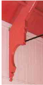
Heritage features include the locally crafted kauri corbels (left) and twelve-light double-hung sash windows with hood moldings (right), which provided the inspiration for our logo.