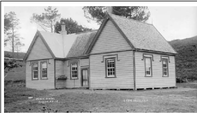
The 1910 photo above shows a timber lath roof on the original RHS room built in 1883 and a corrugated iron roof on LHS 1906 addition.