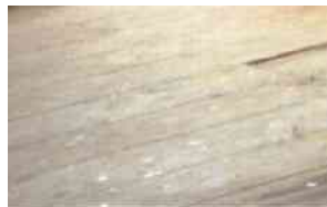
Pupils recall bare kauri walls and floor, as shown in this 1980s photo.

With the roll continuing to grow, in 1903 the porch was enlarged and closed in, to form a 4 metre by 5 metre room. Then in 1906 as the roll had moved up to 64, a new classroom was built in kauri to the left of the old porch. With the roll reaching 100, a fourth classroom was built using rimu timber onto the right side of the building in 1929.